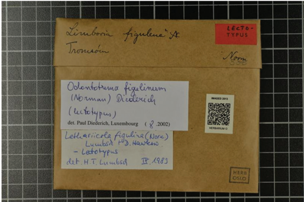
Figure 2. Example of a PURL-URI as a QR-Code, in this example attached to a digitised lichen type specimen in the Natural History Museum, University of Oslo. The QR-Code corresponds to http://purl.org/nhmuio/id/c1a8b878-a4f9-448b-be00-26cbad58b11c .

Scaling up to a larger system will require obtaining funding to support development. A fruitful path would be to align a few organizations that are working nationally or globally (e.g., NEON, iPlant ( http://iplant.org ), iDigBio, Critical Zone Observatories, Consortium of European Taxonomic Facilities) to adopt an early version of the system and to show interoperability and enhanced ability for tracking specimens and their derivatives as an outcome. For those more at the longer-tail of the specimen curation process, such as smaller biocollections or individual labs, incentives for adopting a system to replace the local numbering systems currently in practice could help coalesce efforts, and could further promote the value of such approaches when putting together data management plans (DMP) for funding agencies. In particular, identifier-specific DMP Tool ( https://dmptool.org/ ) template content should be provided. Finally, with the strong growth of handheld devices, the biodiversity informatics community should work to produce tools for assigning identifiers with such devices.