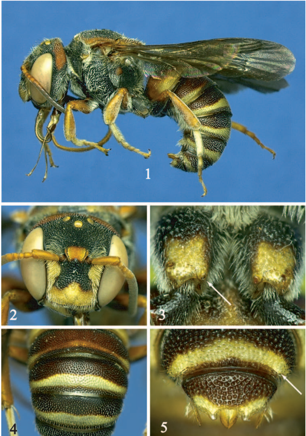
Figures 1–5. Male holotype of Anthidium albitarse Friese 1 lateral habitus 2 facial view 3 hind coxa with arrow pointing to small spine 4 T2 to T4 5 T6 and T7 with arrow pointing to small sublateral spine of T6.