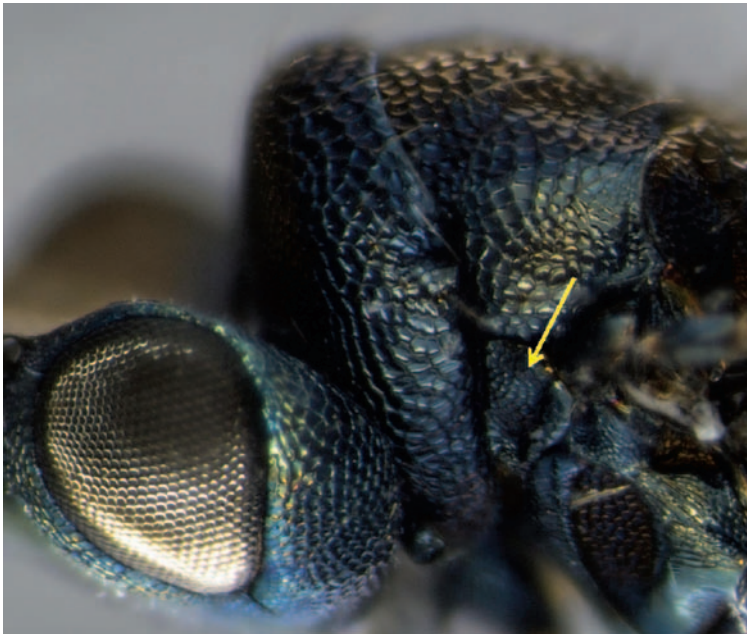
Figure 1. Lateral view of Paracrias pluteus adult female. Lateral view of Paracrias pluteus Hansson, 2002 (Hymenoptera: Eulophidae) adult female with detail to prepectus entirely reticulated and its less bright body color. Teixeiras, Minas Gerais State, Brazil.

Paracrias pluteus belongs to the ordinatus species-group, which is characterized by the forewing which has a narrow membrane along the fore margin of marginal vein, post-marginal vein absent, a very large speculum, and wing membrane distal to speculum sparsely setose (Hansson 2002). Within this group, P. pluteus is distinguished mainly by having a strong, transverse and flat carina on procoxae and with prepectus fully reticulated (Figs 1 and 2). Males are distinguished from females by having all flagellomeres distinctly separated, a longer petiole and by being more colorful (Figs 1 and 2).