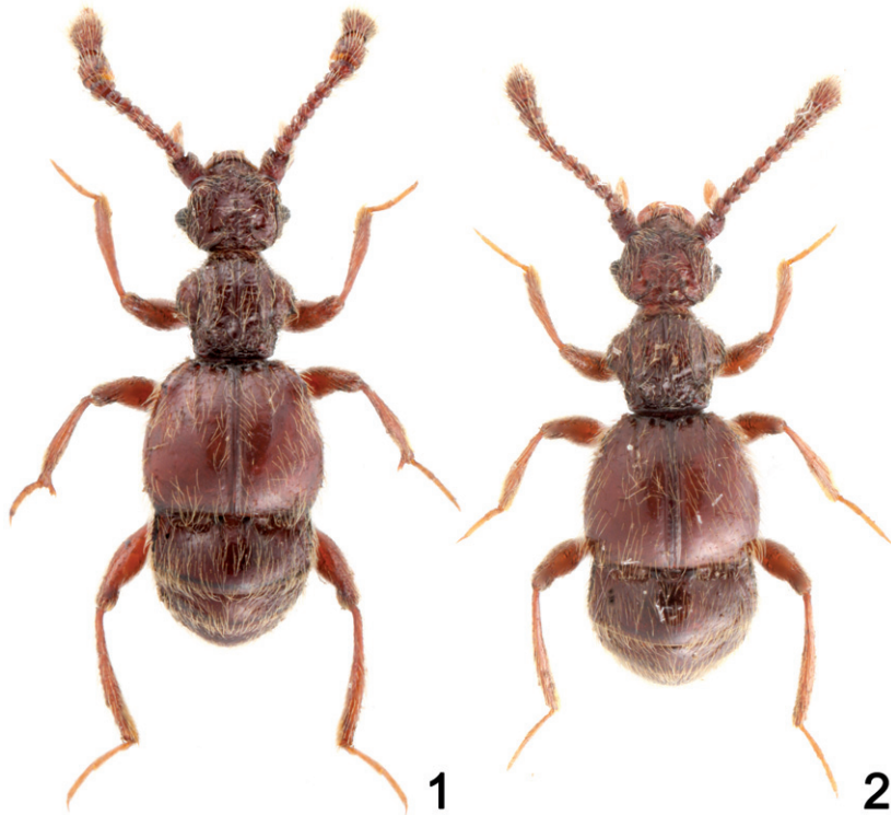
Figures 1–2. Dorsal habitus of Tribasodites spinacaritus sp. n. 1 male 2 female.

Type material. HOLOTYPE, male: ‘CHINA: ZHEJIANG Prov. / Ning’bo City / Tiantongshan Mt./alt. 350 m, 24–26.iv.2009/Ting FENG leg.’ (SHNU). PARATYPES: 4 males, 6 females, same label data as holotype (SHNU)