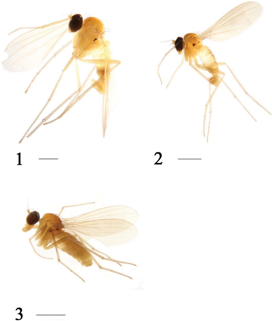
Figures 1–3. Habitus, lateral view. 1 Xanthochlorus tewoensis sp. n. Male. 2 Xanthochlorus gansuensis sp. n. Male. 3 Xanthochlorus gansuensis sp. n. Female. Scale bars: 1 mm.

brown with pale gray pollen, width of face equal to length of first flagellomere. Postocular bristles all yellow. Two oc, two vt. Antenna (Fig. 4) yellow; first flagellomere nearly quadrate, 0.57 times as long as wide; arista brown, basal segment 0.09 times as long as apical segment. Proboscis yellow with yellow hairs; palpus yellow with yellow hairs.