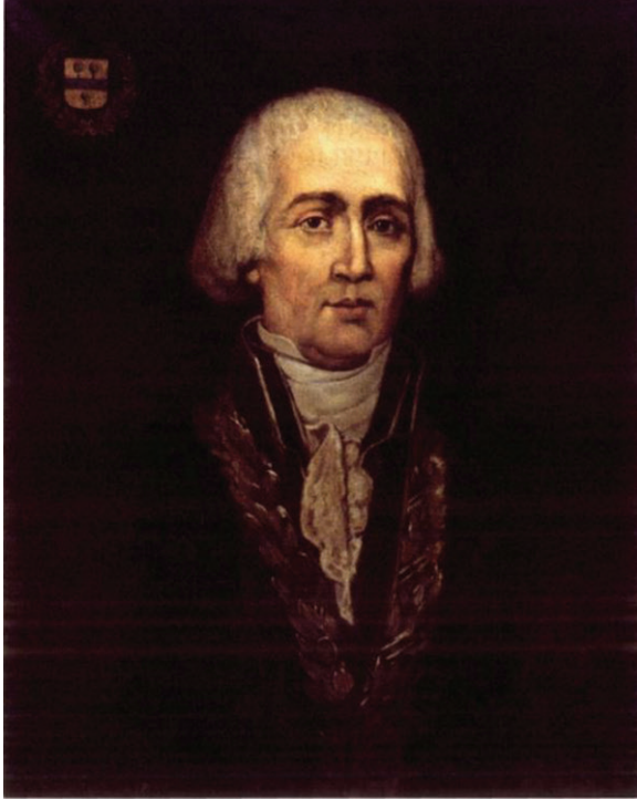
Figure 1. A photographic reproduction of an oil portrait of Guillaume-Antoine Olivier.