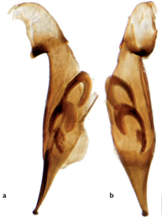
Figure 2. Median lobe of aedeagus of Stenolophus thoracicus . a left lateral view b ventral view.