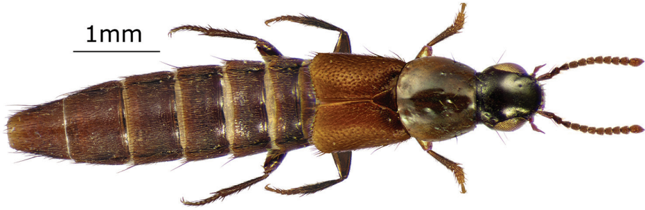
Figure 1. Dorsal habitus of Quedius spencei , sp. n.