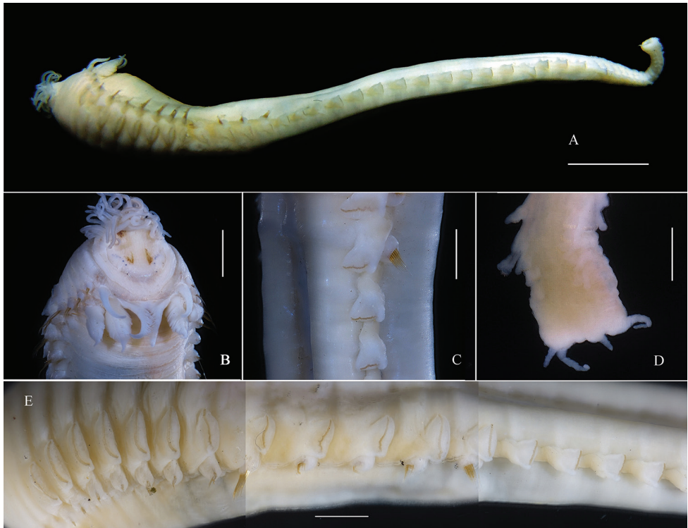
Figure 2. Phyllocomus chinensis sp. n. A whole specimen, lateral view B anterior end, dorsal view C last thoracic and first abdominal segments, lateral view D posterior region (with two pairs of long anal cirri) E consecutive variation of the neuropodia from segment 6 to segment 21. Scale bars A : 4 mm, B, E : 2mm, C–D : 1 mm.

absent. Thirty-four abdominal uncinigerous segments, without rudimentary notopodia (Fig. 2C). Thoracic torus 1 mm long, with approximately 68 uncini. Abdominal torus 0.5 mm long, with approximately 38 uncini. Uncini in abdominal segments are smaller than those of thorax. All uncini with single row of five teeth (Fig. 3D, E). Pygidium with two pairs of long cirri (Fig. 2D).