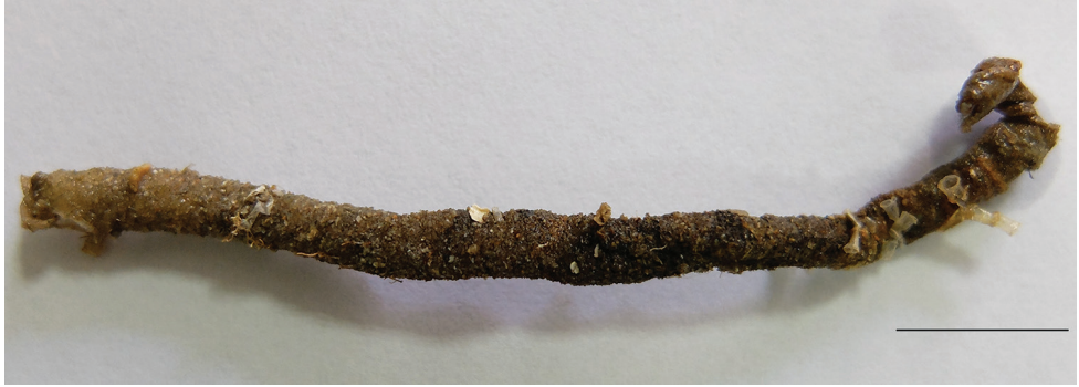
Figure 1. Phyllocomus chinensis sp. n., tube of holotype. Scale bar 2 cm.

Paratype. complete. MBM285072, same locality.