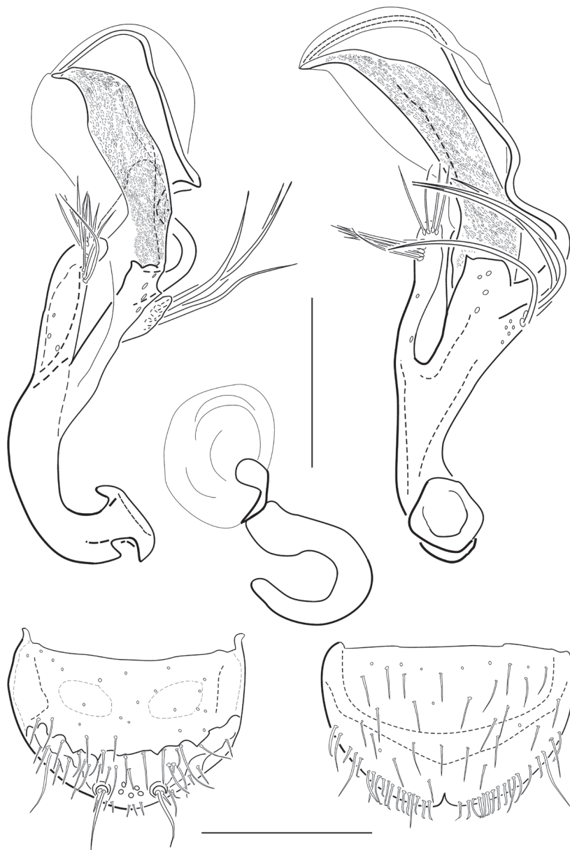
Figure 3. Hydraena ateneo sp. n.: A, B aedeagus (holotype) in ventral ( A ) and lateral ( B ) view C spermatheca D gonocoxite E female tergite X; scale bars = 0.1 mm.

without setae; condyles conspicuous; dorsal plate not surpassing outer plate, with two indistinct, separate cavities (hardly discernible in some specimens).