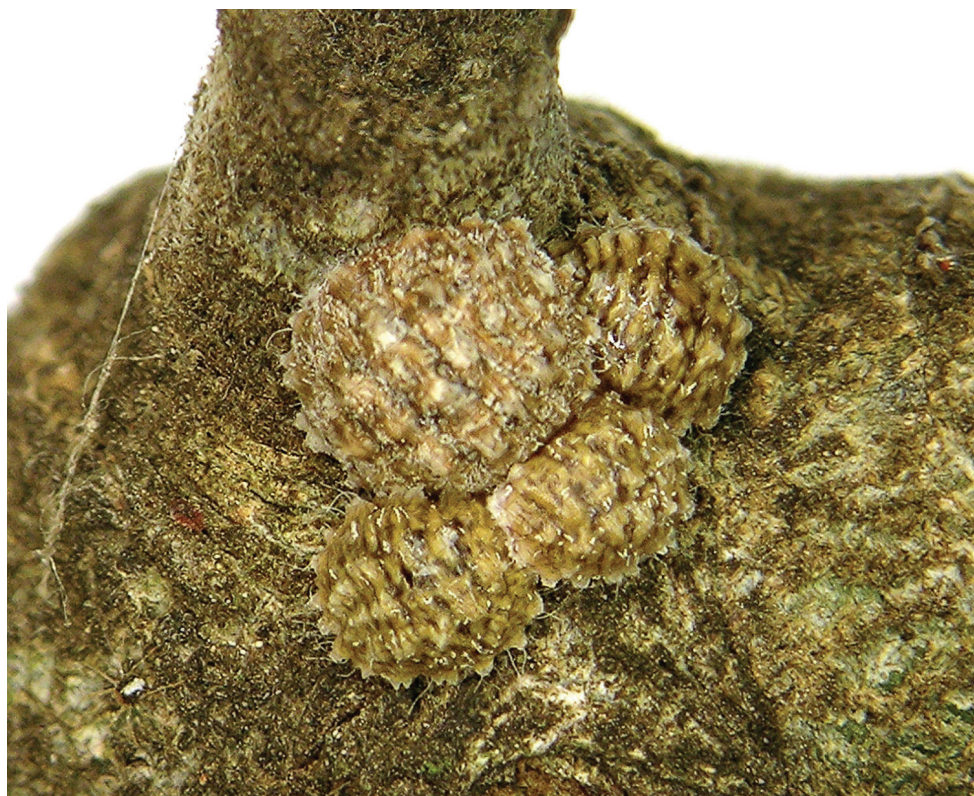
Figure 1. Kermes echinatus Balachowsky young adult female, general appearance.

Description adult female. General appearance. Young, pre-reproductive adult: Oval, soft and slightly convex; dorsum brownish-grey with 4 or 5 black longitudinal and 6–9 black transverse lines formed of dots and lines; 2.5–3.2 mm long and 2–3 mm wide (Fig. 1). Fully-mature reproductive female highly convex; dorsum brownish-grey with black, longitudinal and transverse lines; body tapering posteriorly (Figs 2, 3). Post-reproductive female oval and moderately convex, 2.9–4.4 mm long, 2.7–5.1 mm wide and 3.2–4.8 mm high; dorsum sclerotized; red with 6–9 black, transverse black lines represented as reticulated folds (Fig. 4).