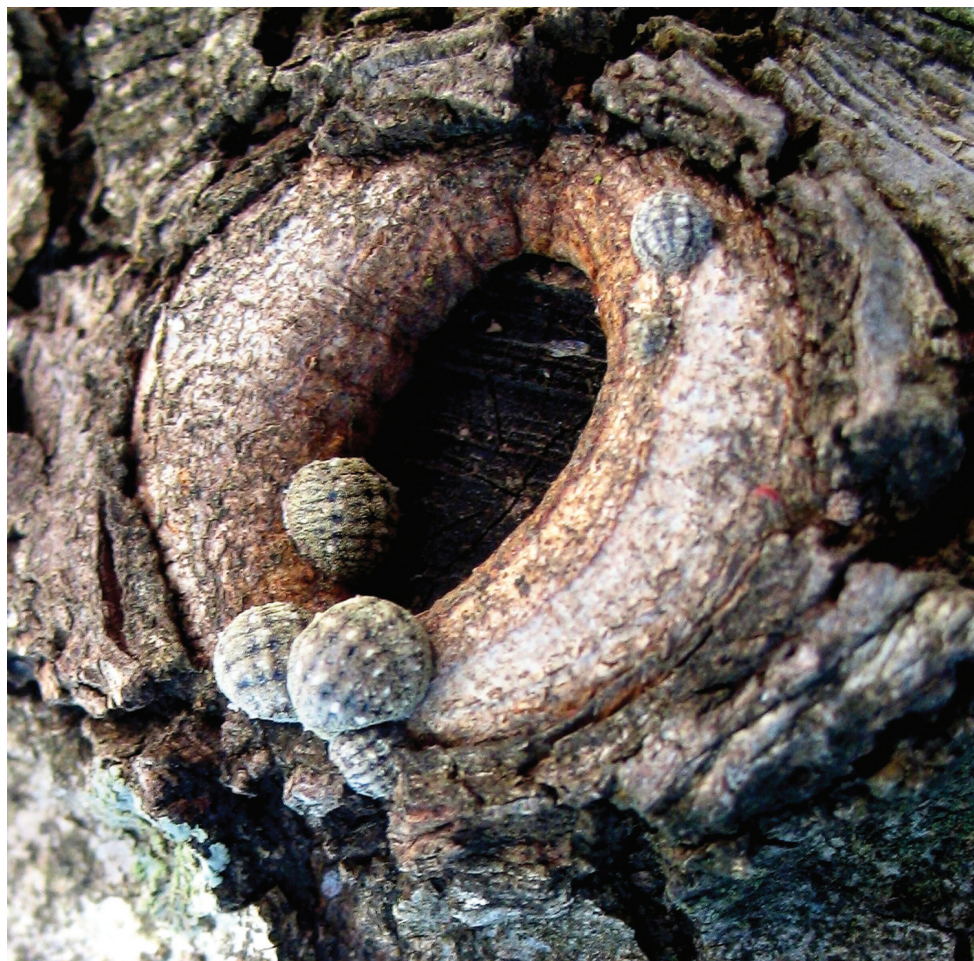
Figure 3. Kermes echinatus Balachowsky gravid females on tree trunk, general appearance.

ginal band. Simple pores 2 \mu\text{m} diameter with a sclerotized rim, interspersed between multilocular pores on abdomen. Ventral setae 7–12 \mu\text{m} long, distributed as follows: about 12 setae just anterior to clypeus between antennae; about 8 setae on median and submedian areas of thorax; about 11 setae mesad to each submarginal band of tubular ducts, in a line from antennae to anal ring; 6 or 8 setae, present in a band along each abdominal segment; plus 2 setae 20–25 \mu\text{m} long, placed medially on each abdominal segment. Microspines each 1–2 \mu\text{m} long, in groups of 3–5, in 3–8 rows on each abdominal segment. Anal ring ventral, forming a complete sclerotized circle; diameter 42–60 \mu\text{m} ; cells absent; with 6 setae, each 25–40 \mu\text{m} long. Other ventral setae 1 pair of setae, each 10–12 \mu\text{m} long, present just anterior to anal ring; 2 pairs of setae, each 10–12 \mu\text{m} long, present posteriorly to anal ring; 1 pair of stout conical setae (similar in shape to marginal spinose setae but shorter), each 10–12 \mu\text{m} long and wide, present on venter slightly above posterior margin; and 1 pair of apical setae, each 33–35 \mu\text{m} long.