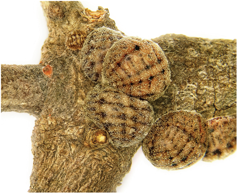
Figure 2. Kermes echinatus Balachowsky mature reproductive female, general appearance.