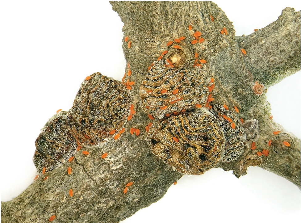
Figure 4. Kermes echinatus Balachowsky female with emerging first-instar nymphs.

First-instar nymph. General appearance. Dorsum and venter red, body oval and tapering posteriorly, 0.37–0.44 mm long and 0.14–0.2 mm wide. Each with a fringe of curly white wax on margins once first-instars settle on branch for feeding (Fig. 6).