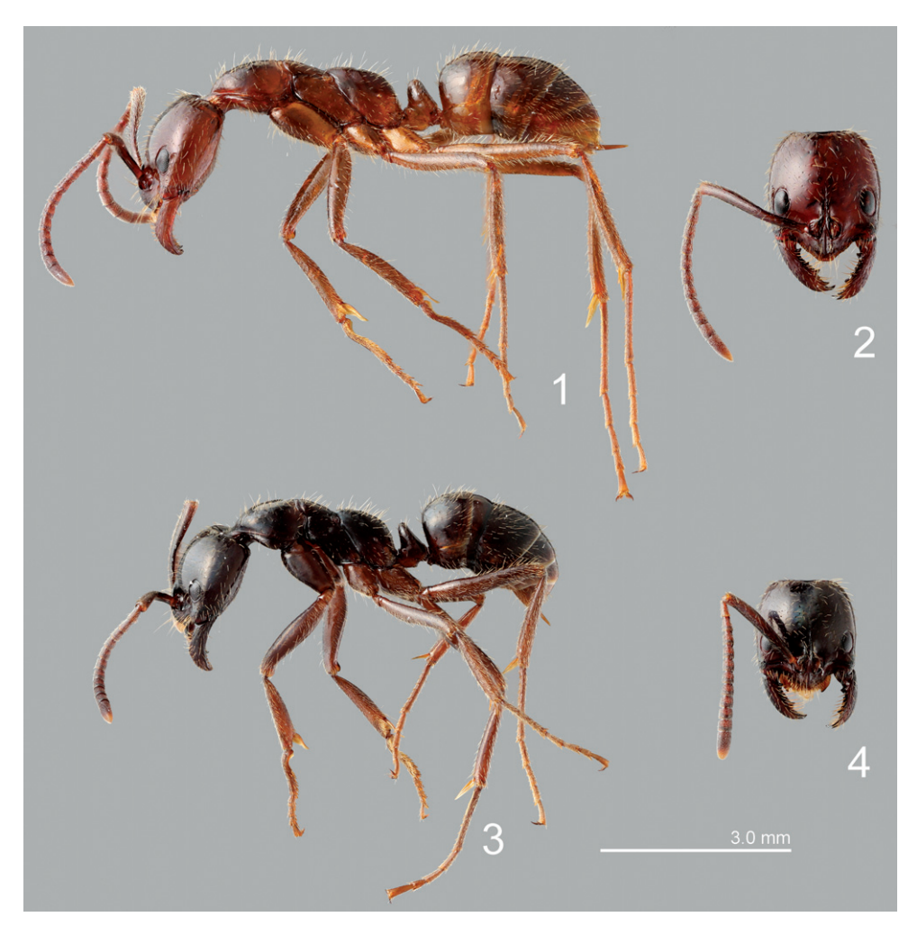
Figures 1–4. Host ants. I Leptogenys distinguenda , lateral view 2 ditto, head 3 L. mutabilis , lateral view 4 ditto, head.