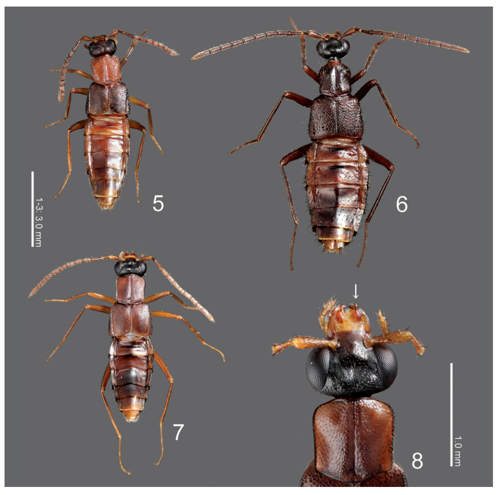
Figures 5–8. Type species of the genera Maschwitzia, Togpelenys and Witteia 5 Maschwitzia ulrichi , dorsal habitus 6 Togpelenys gigantea , dorsal habitus 7 Witteia dentilabrum gen. et sp. n., dorsal habitus 8 ditto, head and pronotum, dorsal view.

von Beeren and V. Witte (12); same data, but VIII 2009, C. von Beeren (10); same data, but IX 2009, Y. Nakase (6); same data, but III 2010, C. von Beeren from the colony of L. mutabilis (2); Bukit Rengit, Pahang, Malaysia (03°35.779 N, 102°10.814' E, altitude 72 m): C. von Beeren and V. Witte (8).