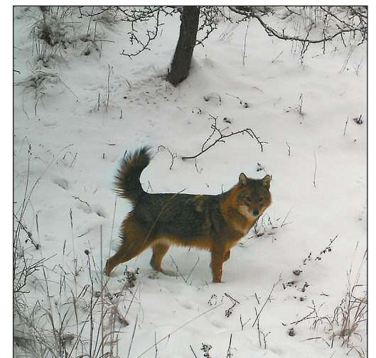
Canis aureus Linnaeus, 1758