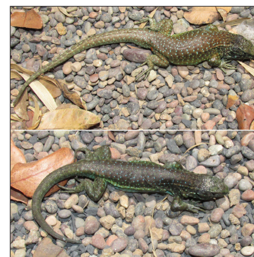
Liolaemus lefrarui Troncoso-Palacios et al., sp. n.