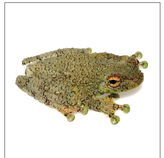
Tepuihyla shushupe Ron et al., sp. n.