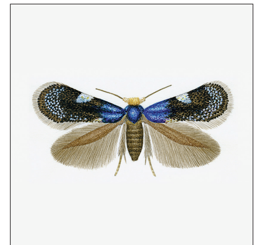
Roscidotoga callicomae Hoare, 2000