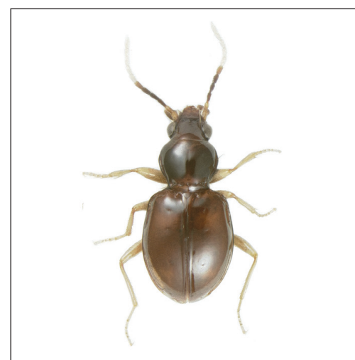
Elaphropus (Nototachys) occidentalis Boyd & Erwin, sp. n.