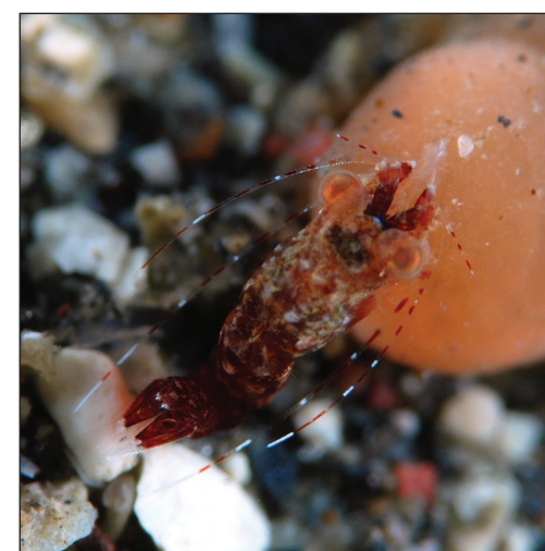
Mysidella hoshinoi Shimomura, sp. n.