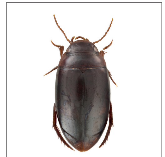
Exocelina varinata Shaverdo & Balke, sp. n.

ZooKeys A peer-reviewed open-access journal Launched to accelerate biodiversity research