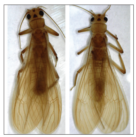
Neoperla chebalinga Chen & Du, sp. n.