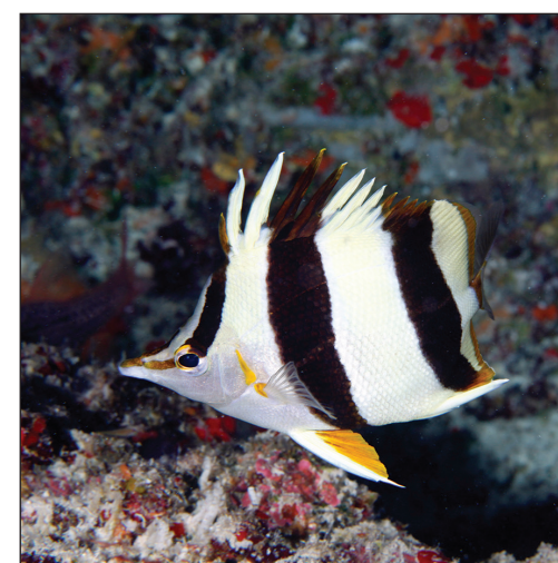
Prognathodes basabei Pyle & Kosaki, sp. n.