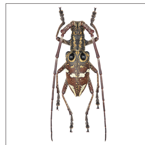
Pseudoechthistatus holzschubi Bi & Lin, sp. n.