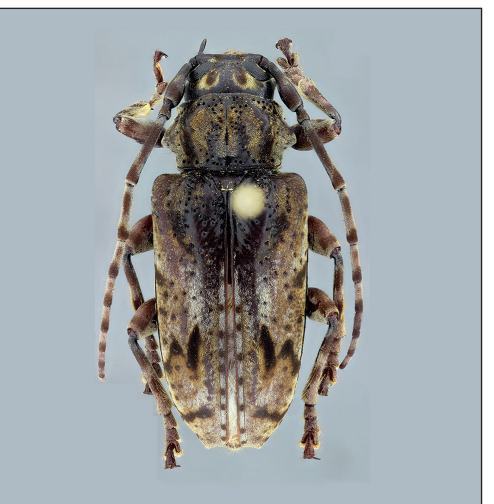
Psapharochrus bezarki Santos-Silva & Galileo, sp. n.

ZooKeys Launched to accelerate biodiversity research