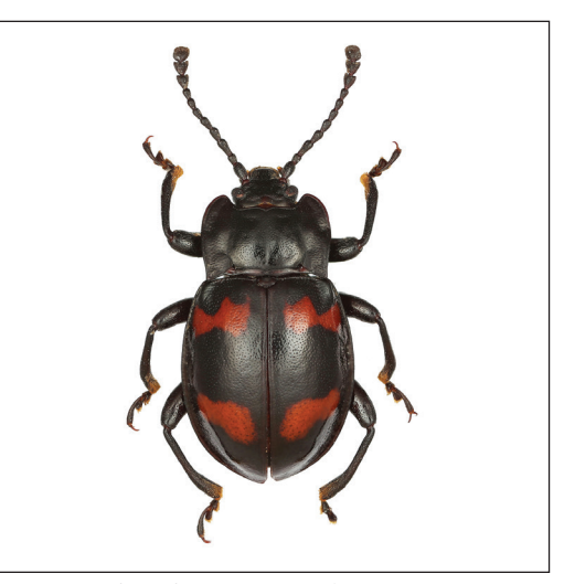
Brachytrycherus conaensis Chang, Bi & Ren, sp. n.