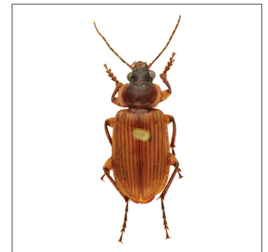
Orthogonius morvanianus Tian & Deuve, sp. n.

ZooKeys Launched to accelerate biodiversity research