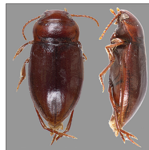
Hydrodessus brevis Miller, sp. n.