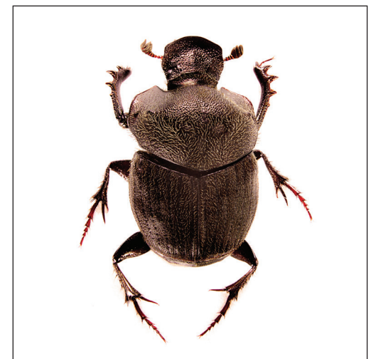
Onthophagus clavijeroi Moctezuma, Rossini & Zunino, sp. n.