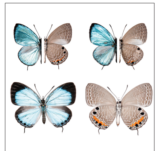
Jamides vasilii Müller, sp. n.

ZooKeys A peer-reviewed open-access journal Launched to accelerate biodiversity research