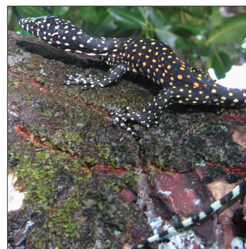
Varanus semotus Weijola, Donnellan & Lindqvist, sp. n.