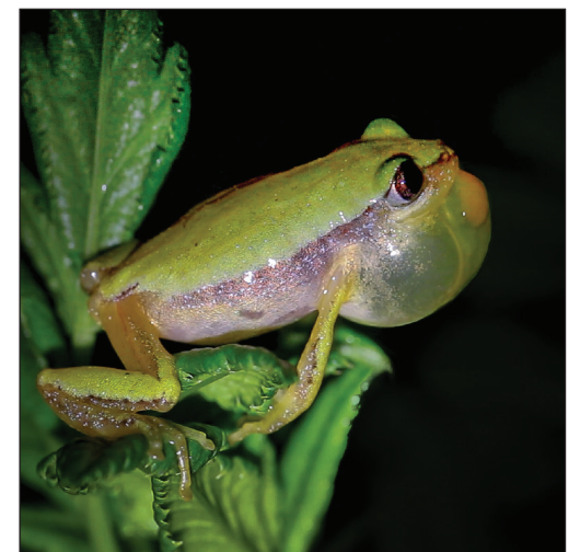
Afrivalus clarkei Lagen, 1974