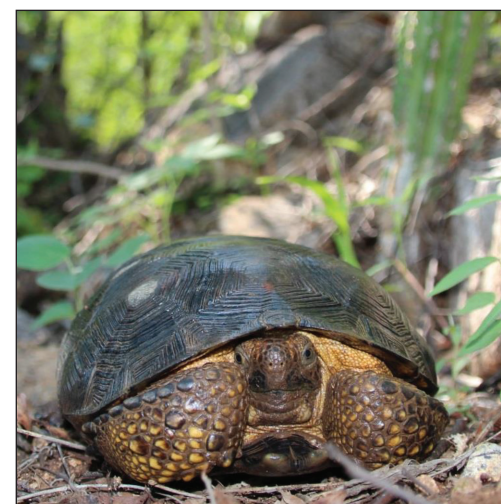
Gopherus evgoodei Edwards et al., sp. n.