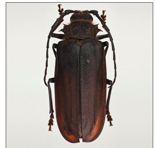
Pixodarus spiniscapus Björnstad & Grobbelaar, sp. n.

ZooKeys A peer-reviewed open-access journal Launched to accelerate biodiversity research