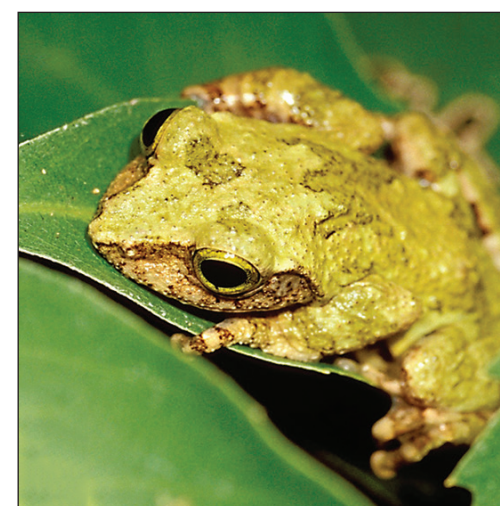
Kurixalus berylliniris Shu-Ping Wu et al., sp. n.