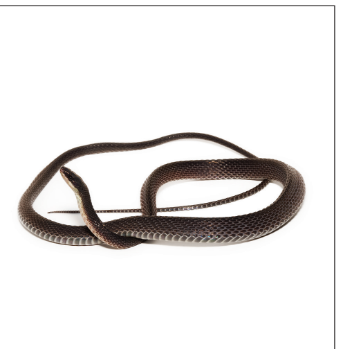
Synophis zamora Torres-Carvajal et al., sp. n.

ZooKeys Launched to accelerate biodiversity research