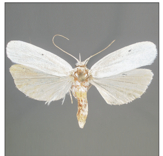
Antaeotricha floridella Hayden & Dickel, sp. n.