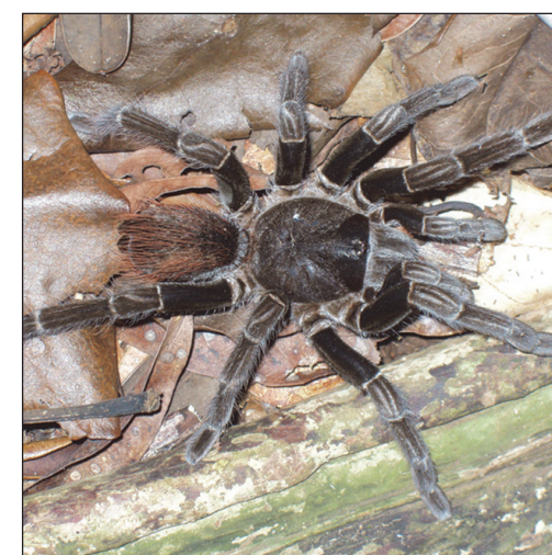
Sericopelma embrithes (Chamberlin & Ivie, 1936)