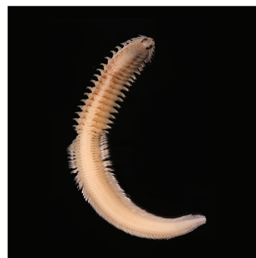
Perinereis helleri (Grube, 1878)