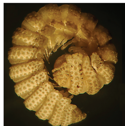
Eutrichodesmus triangularis Golovatch et al., sp. n