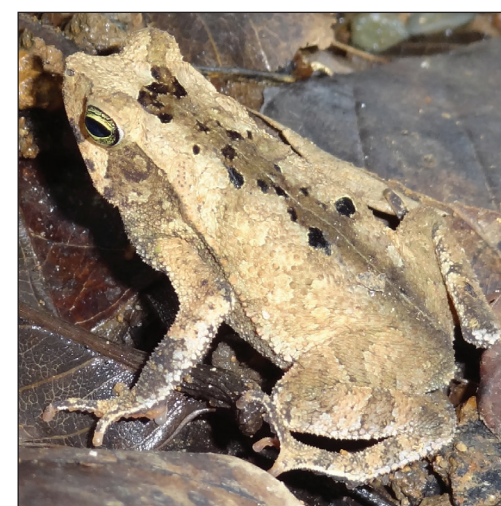
Rhinella alata (Thomiot, 1884)