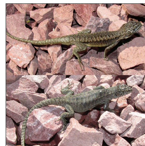
Liolaemus scorialis Troncoso-Palacios et al., sp. n