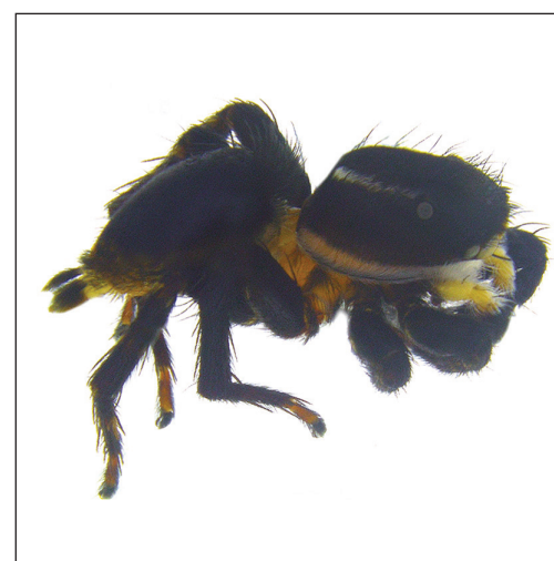
Stenaelurillus albus sp. n