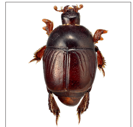
Exaesiopus therondi Lackner, sp. n.