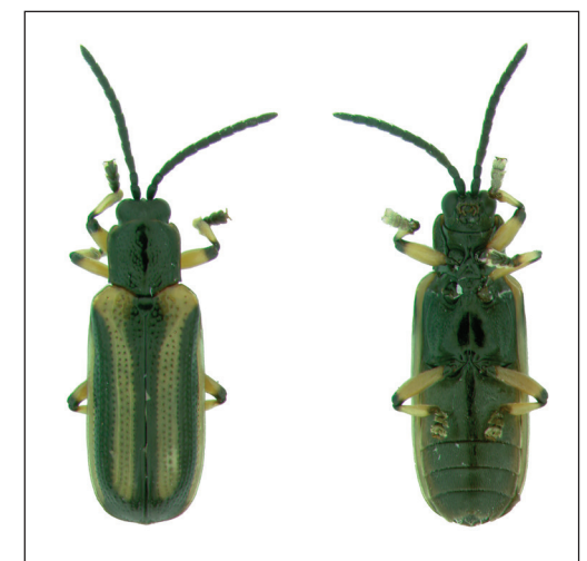
Cephaloleia kuprewiczae García-Robledo & Staines, sp. n.