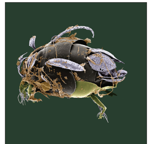
Excelsotarsonemus tupi Rezende, Lofego & Ochoa, sp. n