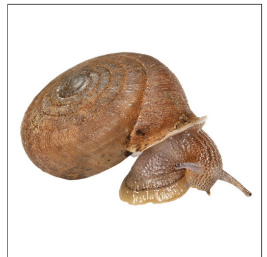
Gudeodiscus (Gudeodiscus) giardi giardi (Fischer, 1898)