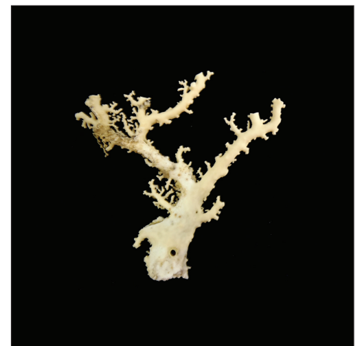
Errina labrosa Pica, Cairns & Puce, sp. n.