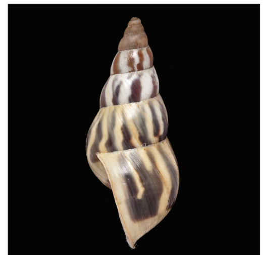
Leiostracus subtuszonatus (Pilsbry, 1899)