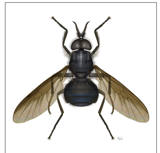
Cyphomyia baoruco Woodley, sp. n.