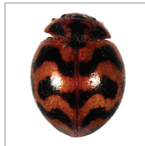
Cynegetis chinensis Wang & Ren, sp. n.

ZooKeys Launched to accelerate biodiversity research