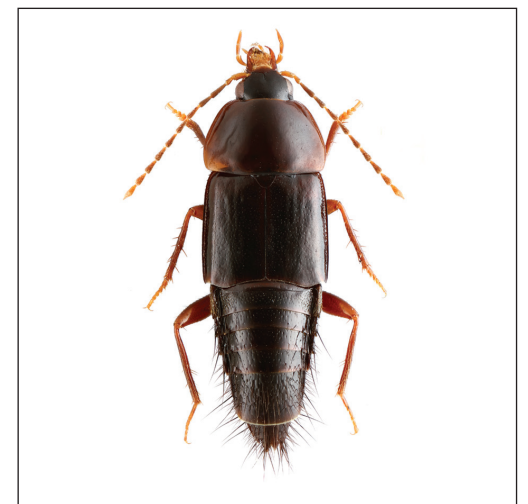
Nitidotachinus brunneus Zheng, Li & Zhao, sp. n.